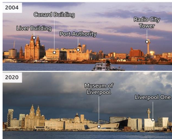
How Liverpool's waterfront has changed