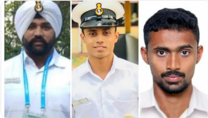
रक्षा मंत्री कार्यालय/ RMO India and 9 others