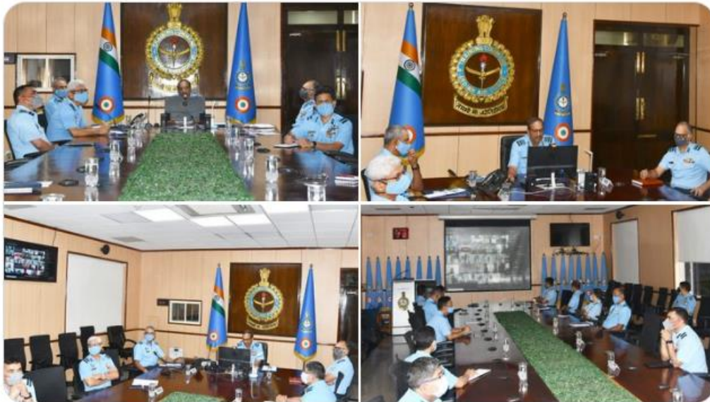
SSBCrack and 9 others

More than 150 Officers from various Training Institutions of IAF participated.