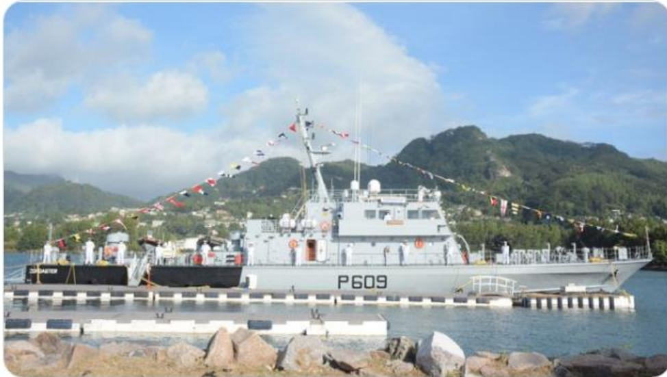
Seychelles People's Defence Forces and 9 others

Congratulations to #SeychellesCoastGuard (SCG) on commissioning of Military Patrol Vessel, SCG Ship - SCGS Zoroaster on this special day. #IndianNavy is happy to be associated with this endeavour & support capacity building of the SPDF in any manner to ensure safe & secure seas.