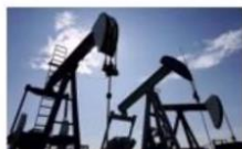
Crude Oil (8.98%)