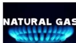
Natural Gas (6.88%)