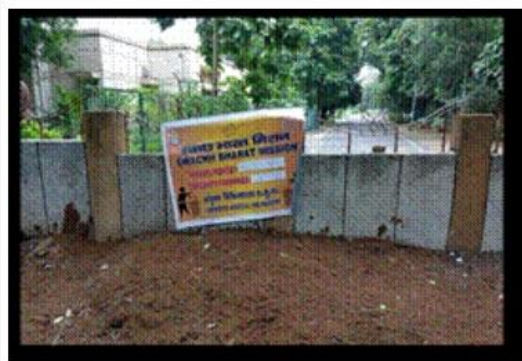
Before and After Images of Backside Area of Admin Block, CH Manesar(NSG)