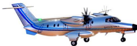
19-SEAT LIGHT TRANSPORT AIRCRAFT

Indigenous Next-Gen Commuter Transport Aircraft.