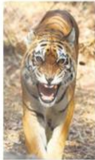
Steady rise: A tiger at Van Vihar National Park in Bhopal on Sunday.