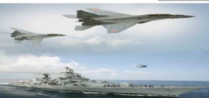
Date of Opening - 04 Aug 2023

Last date for Online Application – 20 Aug 2023