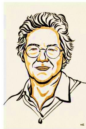
Anne L'Huillier