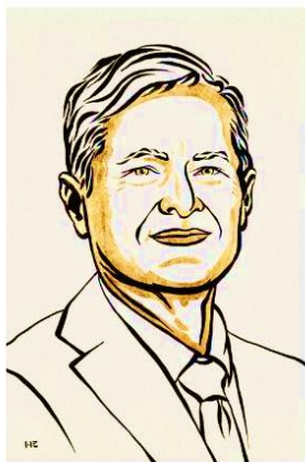
Ferenc Krausz