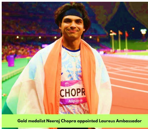
Gold medalist Neeraj Chopra appointed Laureus Ambassador