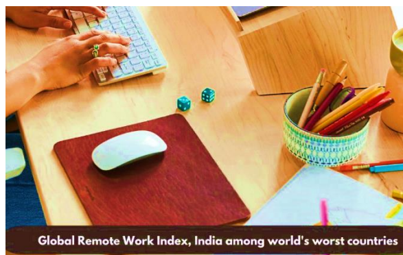
Global Remote Work Index, India among world's worst countries