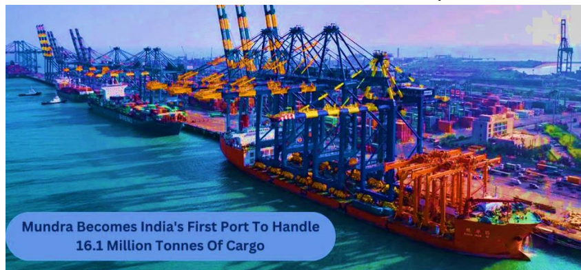
Mudra Becomes India's First Port To Handle 16.1 Million Tonnes Of Cargo