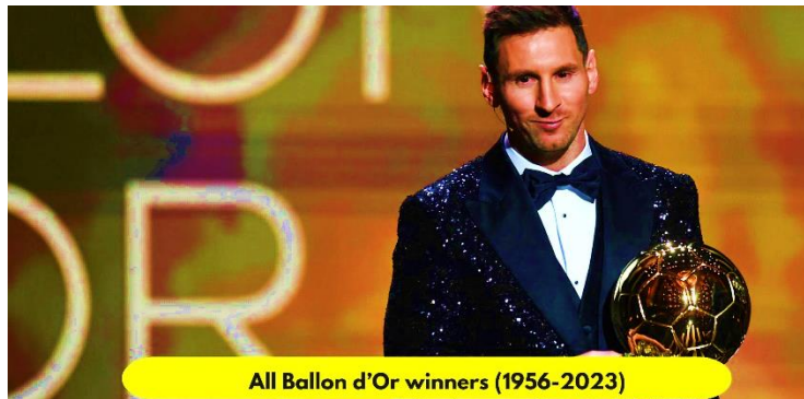
All Ballon d'Or winners (1956-2023)