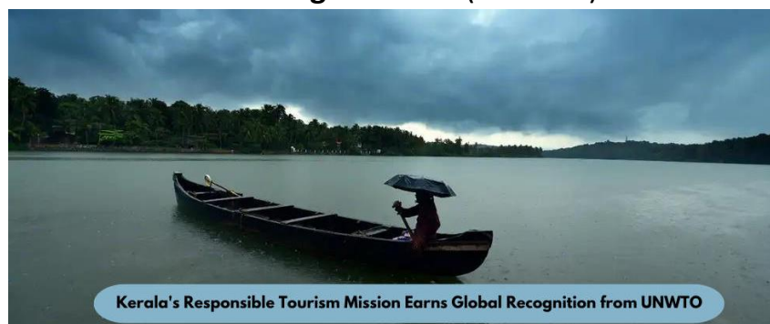
Kerala's Responsible Tourism Mission Earns Global Recognition from UNWTO