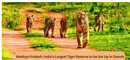
Madhya Pradesh: India's Largest Tiger Reserve to be Set Up in Damoh