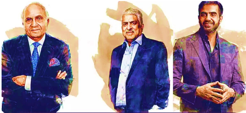
Nandan Nilekani, KP Singh, Nikhil Kamath On Forbes Asia Heroes Of Philanthropy List