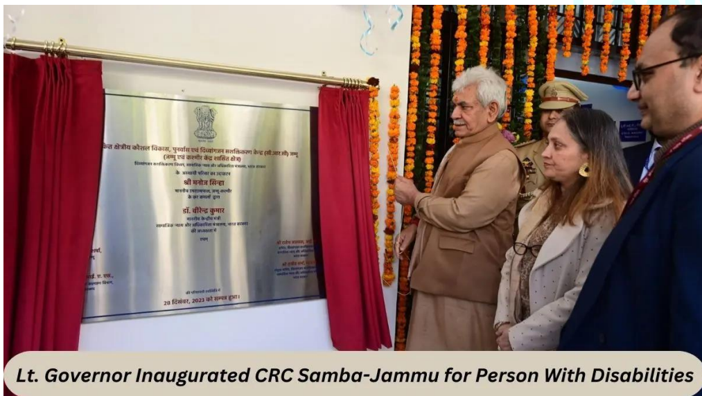
Lt. Governor Inaugurated CRC Samba-Jammu for Person With Disabilities