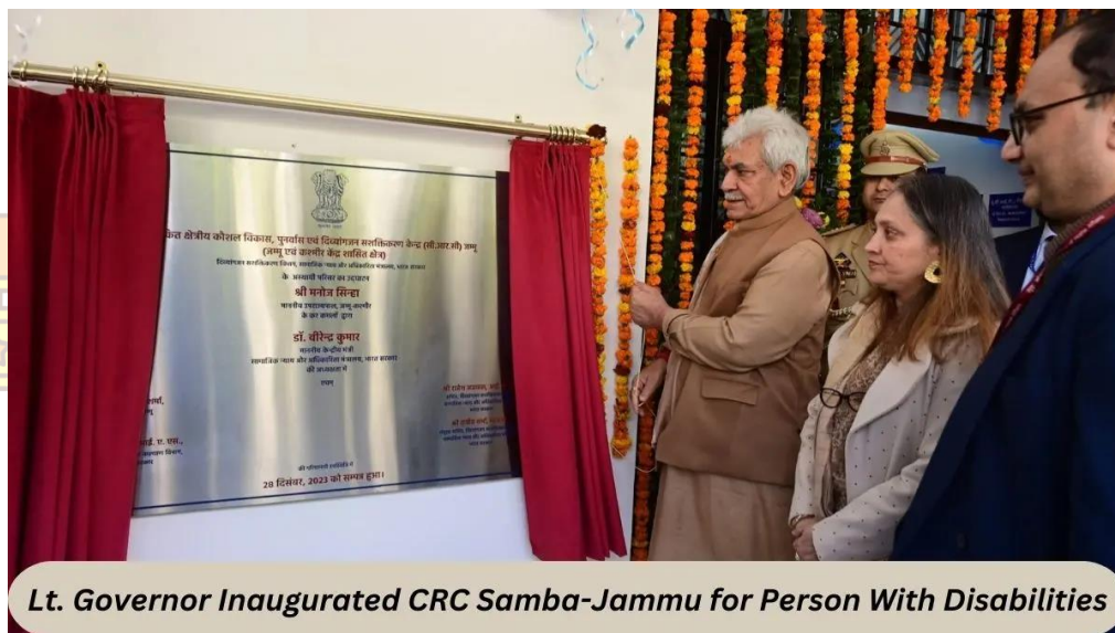
Lt. Governor Inaugurated CRC Samba-Jammu for Person With Disabilities