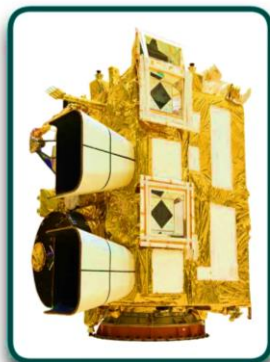
INSAT - 3DS SATELITE

Complete details about INSAT - 3DS Satellite - INSAT - 3DS UPSC