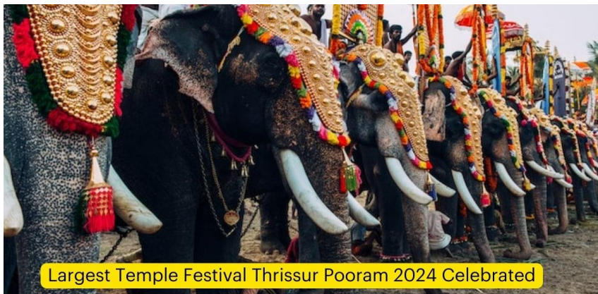
Largest Temple Festival Thrissur Pooram 2024 Celebrated