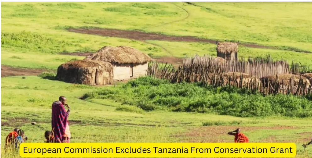
European Commission Excludes Tanzania From Conservation Grant