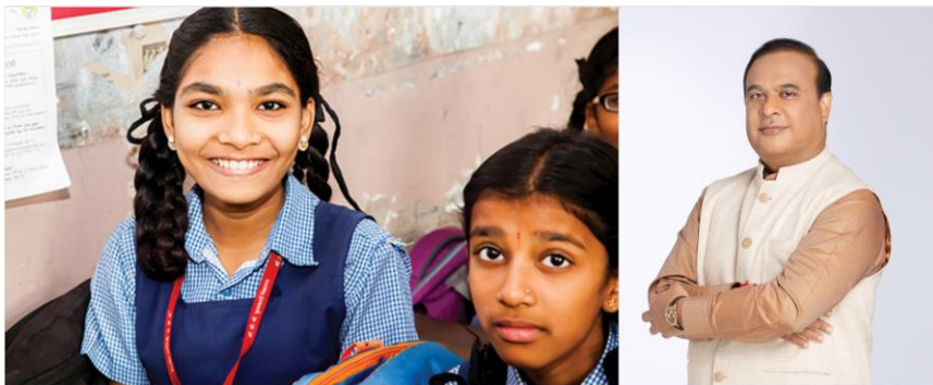
Assam Mukhya Mantri Nijut Moina Scheme