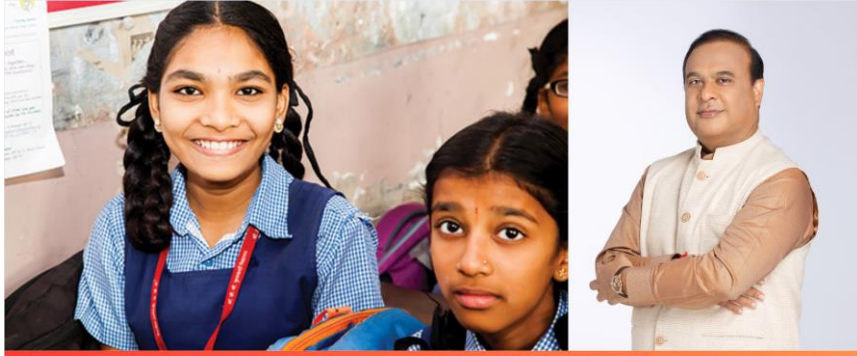
Assam Mukhya Mantri Nijut Moina Scheme