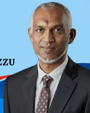
DR MOHAMED MUIZZU Maldives President

Congratulations to Prime Minister Narendra Modi and the BJP and BJP-led NDA, on the success in the 2024 Indian General Election, for the third consecutive term. I look forward to working together to advance our shared interests in pursuit of shared prosperity and stability for our two countries.