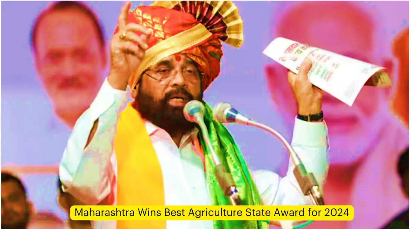
Maharashtra Wins Best Agriculture State Award for 2024