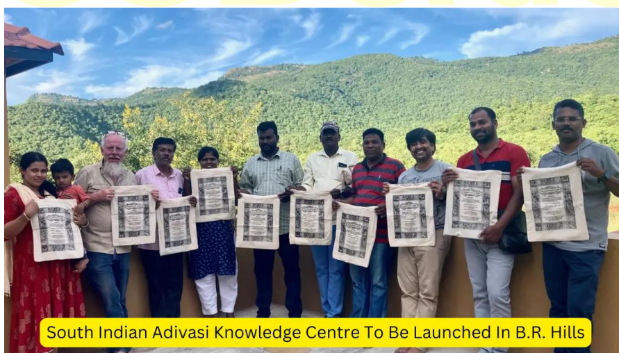
South Indian Adivasi Knowledge Centre To Be Launched In B.R. Hills