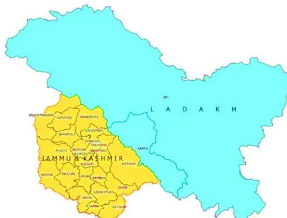
Ladakh Gets Five New District