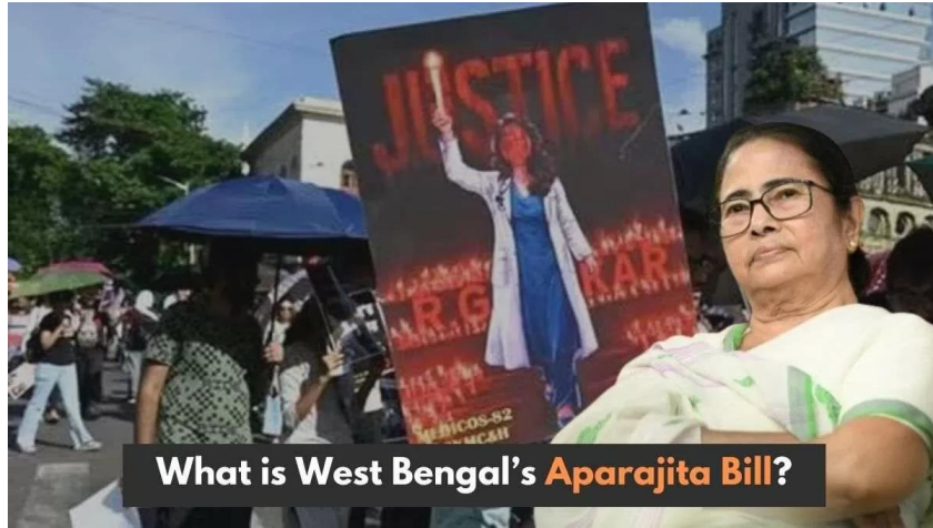
What is West Bengal's Aparajita Bill ?