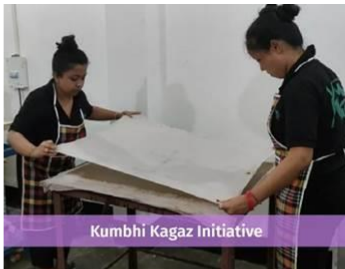
Kumbhi Kagaz Initiative