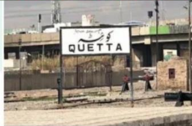
9-coach Jaffar Exp started from Quetta stn

> Balochistan Liberation Army warned of 'severe consequences' if forces attempt a rescue op