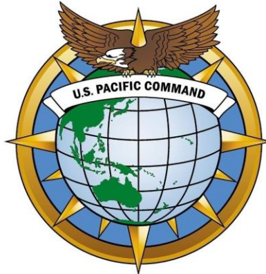
Logo of US Pacific Command (USPACOM)

US Indo-Pacific Command (USINDOPACOM) restores name to US Pacific Command (USPACOM)